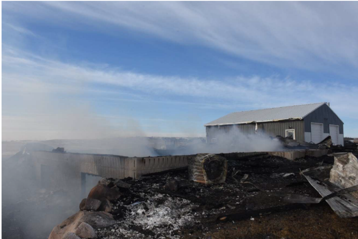
Figure 2: Photograph 14 - Northeast View of Structure, Collapsed into the Basement

The examination began with a 360° walk around that started on the north side and went in a counterclockwise direction. The structure sustained mass consumption and had collapsed to the basement. See Figure 2.