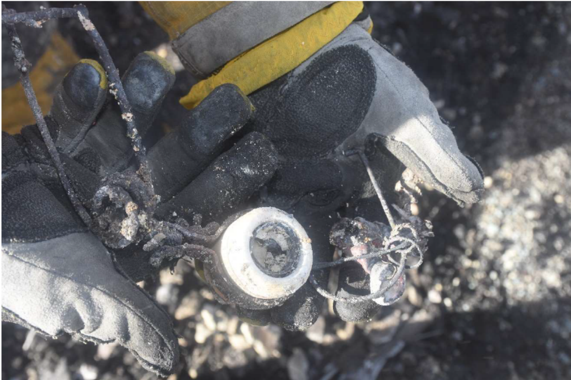
Figure 8: Photograph 98 - Connected Clamp & Ceramic Socket Housing

Heat lamp components were located in the northwest corner of the south patio. Two ceramic housings and two wire clamps. One set of metal clamps and ceramic housing were located in a separated fashion, the other clamp and ceramic housing was connected. See Figure 8.