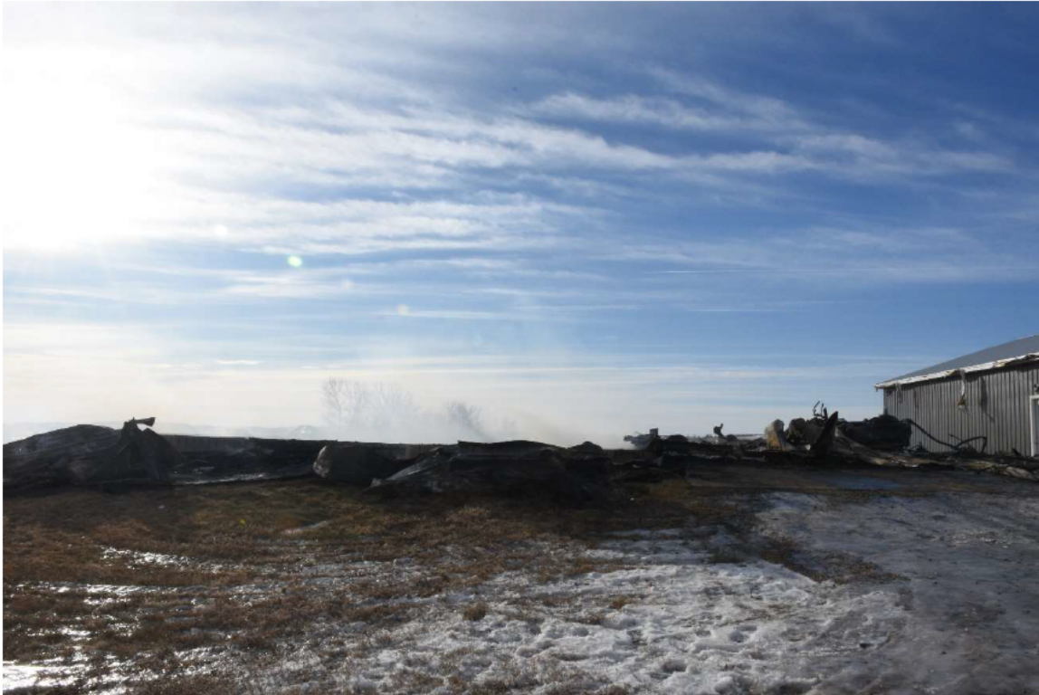
Figure 1: Photograph 2 - North Side of Structure

On January 28, 2025, a fire occurred at a residential home at 2510 30 th Ave SW, Center, ND. See Figure 1.