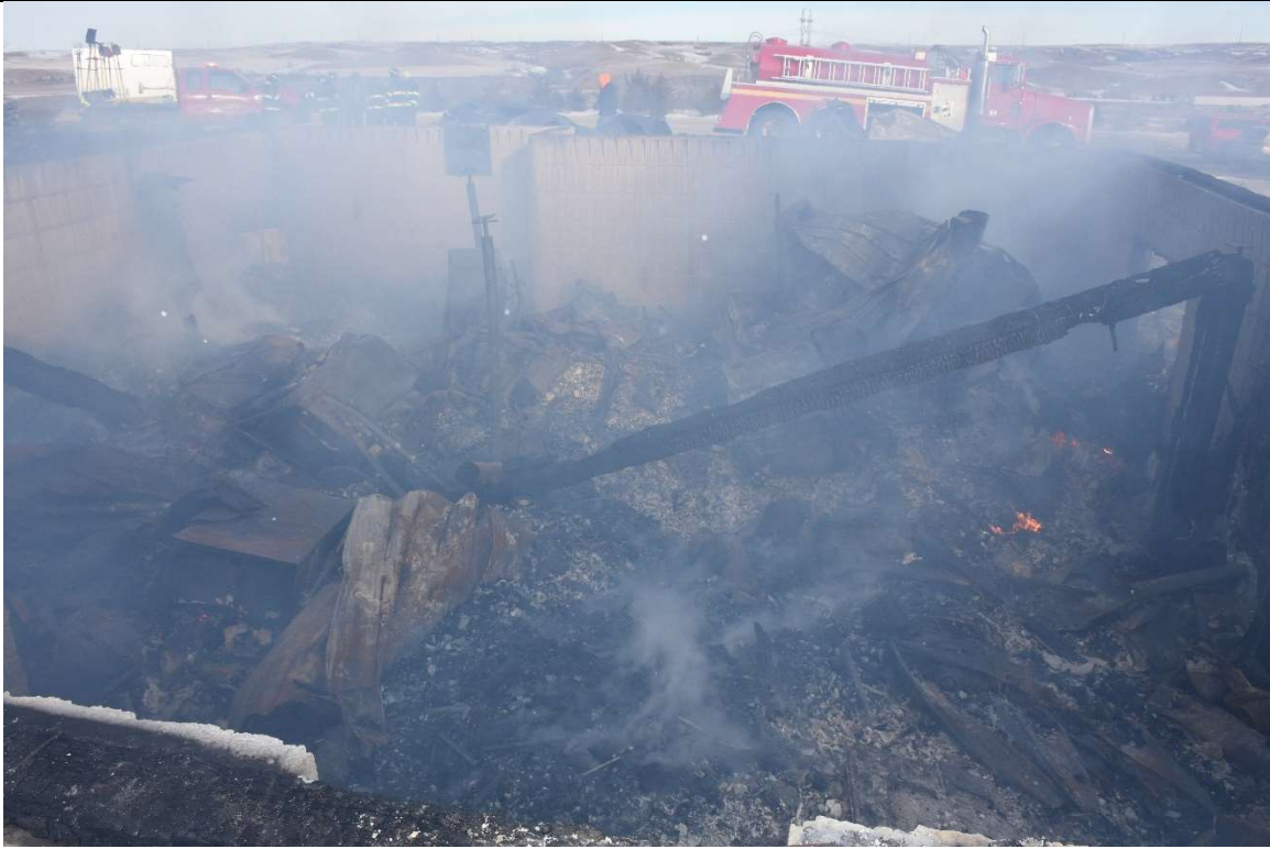
Figure 7: Photograph 19 - South View of Interior

The adult victim was located in the west portion of the structure, approximately in the center of the west wall that was oriented north/south. The location of the body remains corresponded with the staircase location in a provided house interior diagram. The body was located in an east/west orientation. The body was recovered and removed from the structure and transported to the University of North Dakota School of Medicine and Health Services.