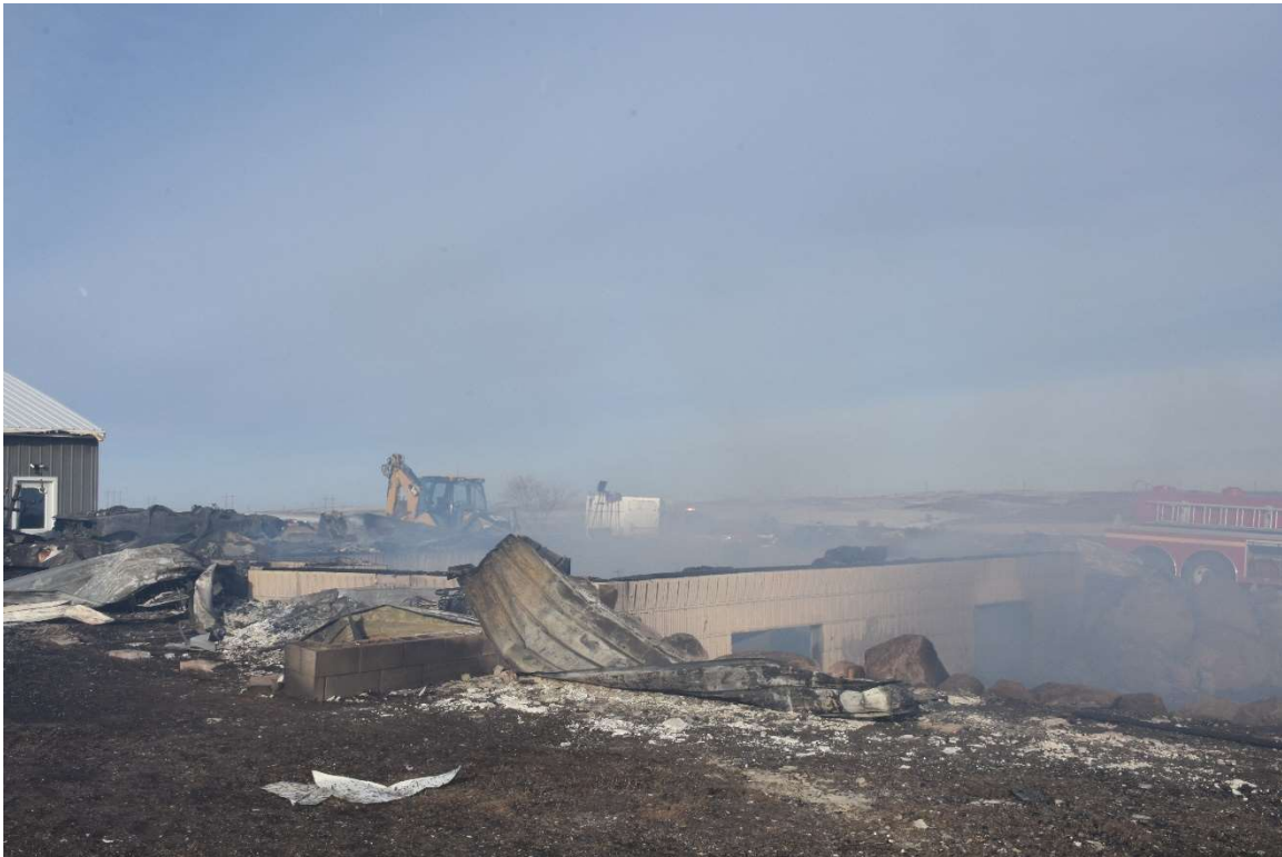
Figure 3: Photograph 11 - Southeast View; Metal Roofing Material

No cigarettes, smoking materials, or smoking paraphernalia were viewed upon the ground around the house, garage, or detached garage.