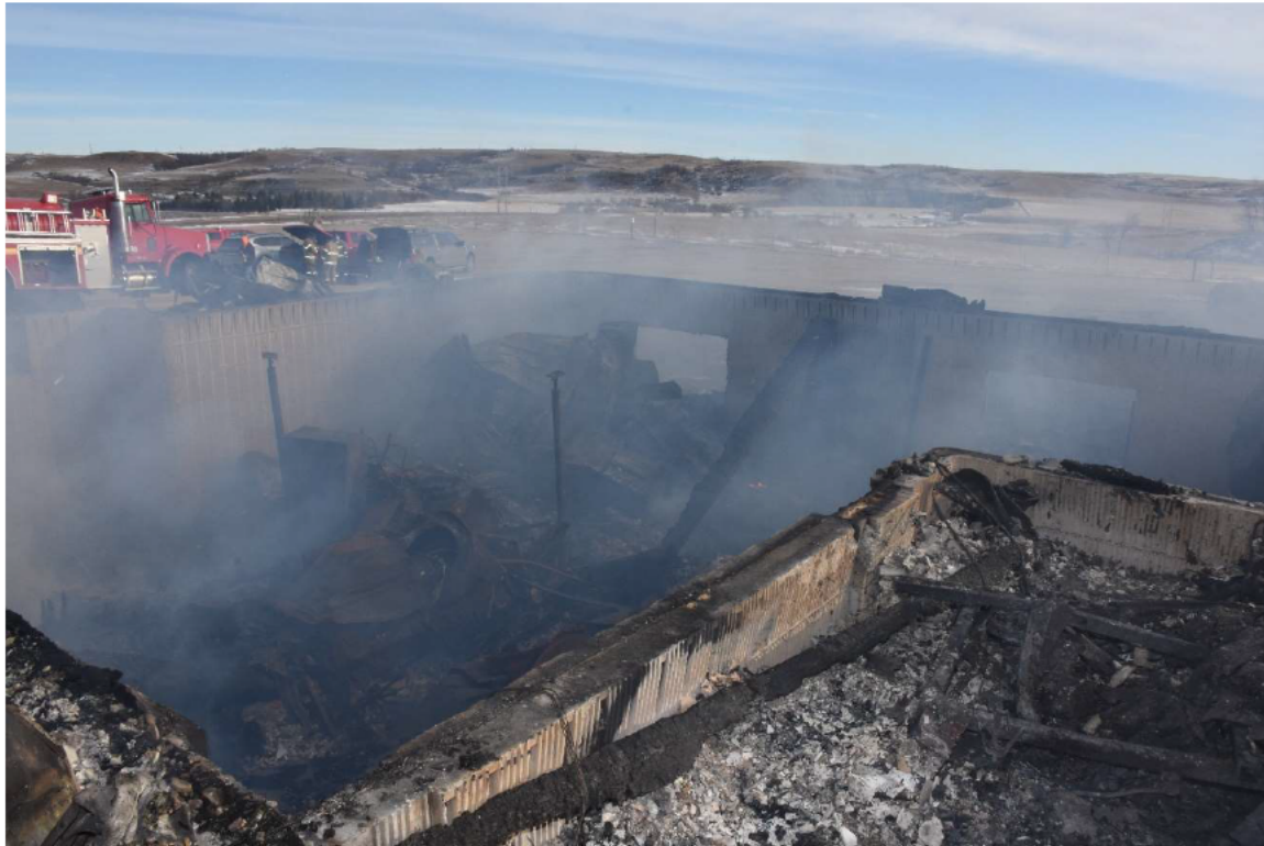
Figure 6: Photograph 18 - Southwest Interior View of Structure

Due to the extent of the damage, safety concerns and the collapse of the structure into the basement, the interior examination was limited to the areas that were cleared using heavy equipment during the search for the unaccounted-for adult victim. See Figure 6.