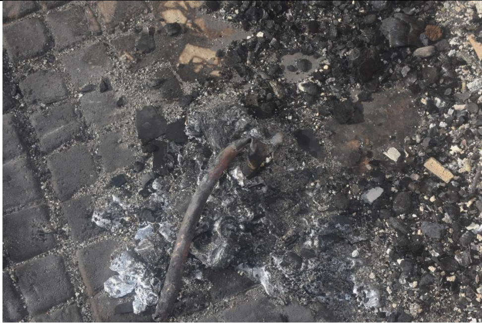
Figure 4: Photograph 107 - Metal Piping Located on South Patio

The layering continued on the west half of the patio. Electrical wiring, a breaker panel door cover, and charred wood materials were located. Amongst the fire debris, two ceramic base sockets and two metal clamps were located. The ceramic base sockets were intact. The metal clamps sustained heat induced color change. One ceramic base socket and metal clamp were located still connected. The other components were not connected together at the time of discovery. Charred wood material and wiring were located amongst the fire debris connected together. Material fragments, similar to fabric, was located on portions of the wood material. Both sides of the wood material had similar charring and mass loss patterns. The wiring did not have any insulation. The electrical wiring located in the west half of the patio was not all intact, as multiple different wire fragments were located amongst the debris. Globules were located on various wire fragments. The electrical panel door cover located in the area sustained oxidation and heat induced color change. See Figure 5.