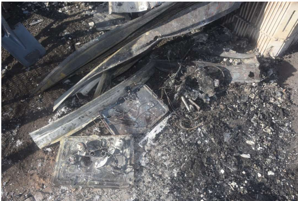
Figure 5: Photograph 110 - Items Located During Layering Process

The layering continued on the west half of the patio. Electrical wiring, a breaker panel door cover, and charred wood materials were located. Amongst the fire debris, two ceramic base sockets and two metal clamps were located. The ceramic base sockets were intact. The metal clamps sustained heat induced color change. One ceramic base socket and metal clamp were located still connected. The other components were not connected together at the time of discovery. Charred wood material and wiring were located amongst the fire debris connected together. Material fragments, similar to fabric, was located on portions of the wood material. Both sides of the wood material had similar charring and mass loss patterns. The wiring did not have any insulation. The electrical wiring located in the west half of the patio was not all intact, as multiple different wire fragments were located amongst the debris. Globules were located on various wire fragments. The electrical panel door cover located in the area sustained oxidation and heat induced color change. See Figure 5.